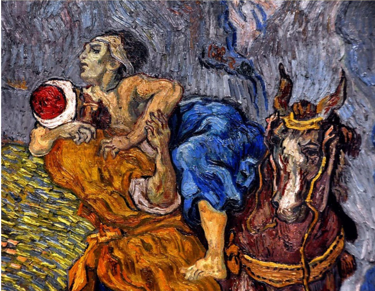
Vincent van Gogh - The Good Samaritan